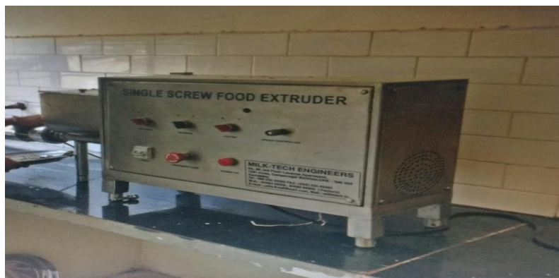
Figure 1 : Single screw extruder used for Research