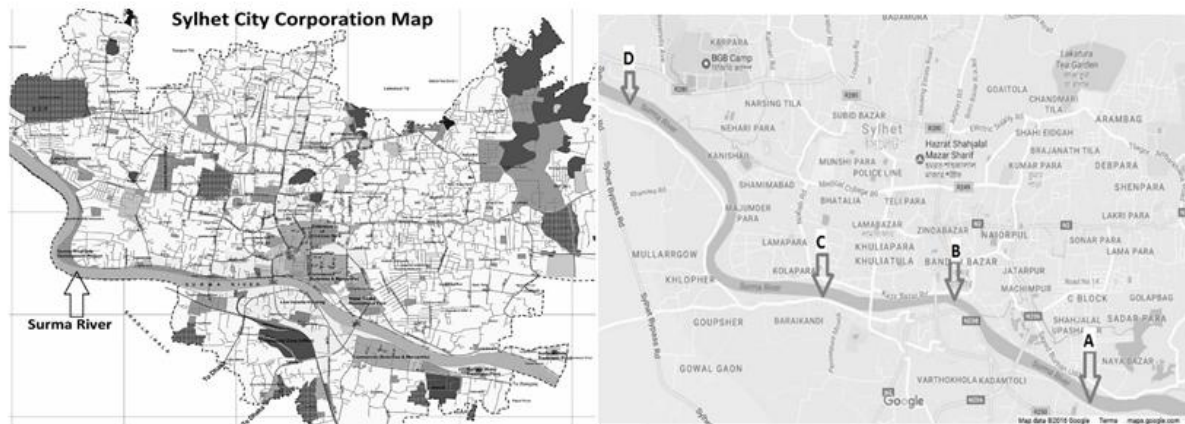
Fig: 1 Sylhet City Corporation Map Fig: 2 Sampling Locations of Water Samples