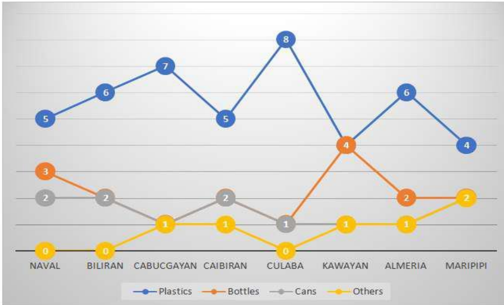
TABLE 1 Causes of Marine Pollution by Municipality in the Province of Biliran

Table I, shown the causes of marine pollution by municipality in the Province of Biliran. In fact, out of eight (8) municipalities in the Province of Biliran. Plastics obtained eighty (80%) percent in which appeared the highest causes of marine pollution due to improper disposal of garbage, especially in the Municipality of Culaba. It is possible because this municipality has lack of garbage facility and it is also facing to the nearby cities ( Catbalogan City, Calbayog City, and Tacloban City ) in mainland Leyte. Plastics, bottles, cans, and others came from these cities because of the dynamic external forces such as wind, wave & typhoon. However, other causes like wood, foam and other forms of garbage were denoted the lowest percentage contribution when it comes to marine pollution in all municipalities in the province. Results supported that plastic debris kills 100,000 marine mammals and 2 million sea birds die annually [5]. Moreover, solid waste likes plastics are the major marine pollutant not only in the Province of Biliran but as well as other major cities such as Quezon City, Pasay City, Marikina City, and other cities in Metro Manila [1].