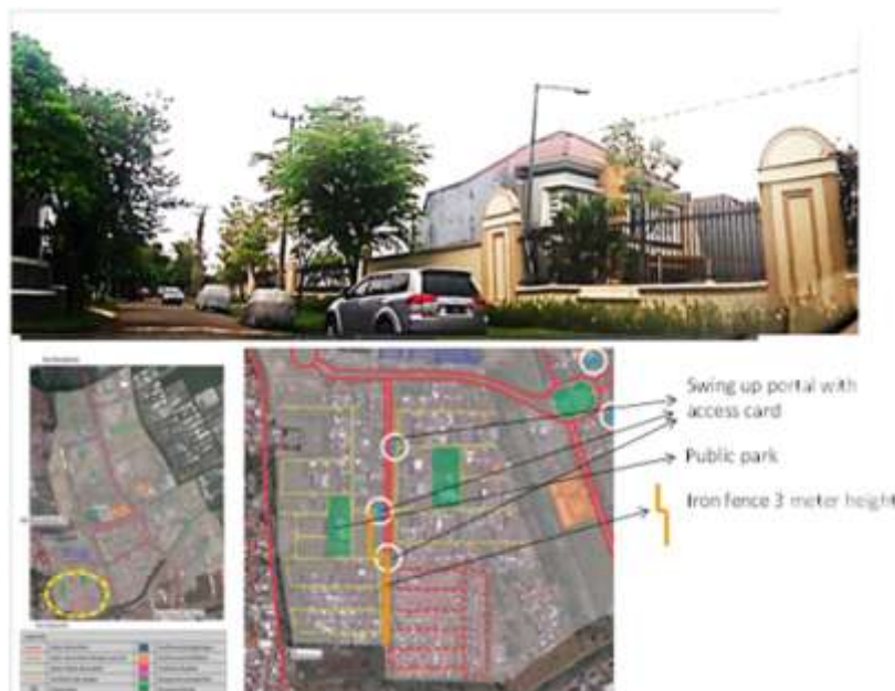
Figure 4. Gating inside cluster

After applying gating in all clusters, houses also equipped with fence. Another interesting situation occurs in the southern part of Pakuwon City where clusters are not only equipped with swing-up portals and security guards but are also fenced with a 3-meter hollow iron. It could be said that gating at cluster's main entrance is not enough so that residents need to fence their sub-clusters or houses too (Fig. 4). This is where gating appears to be manifestation of security aspect.