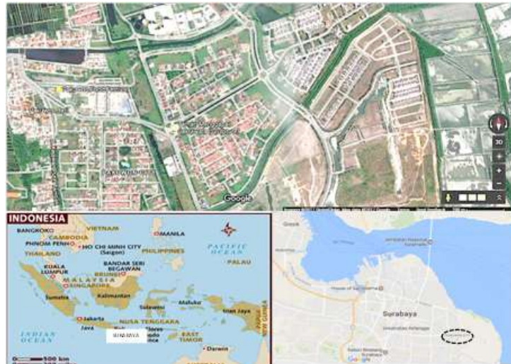
Figure 1. Location of Pakuwon City residential

Pakuwon City is located in east of Surabaya, Indonesia. It is a large scale residential development consists of 2694 unit houses took over land of 400 ha. It is one of the best residential for middle and high class of society in Surabaya. Location of case study is showed in Fig. 1.