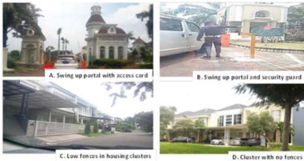
Figure 3. Various gating features

Gating does not appear on the main entrance of GC as is often seen in the US, but rather on clusters or blocks deeper inside. Gating can be iron fencing driven by security officers, swing-up portals that are mechanically driven with access card or a combination of swing up portals and security officers. Multiple locations in Pakuwon City require non-resident visitors to leave their IDs before entering the cluster or block. Here gating is applied by swing up portal and access card so that only the residents can access the cluster (Figure 3).