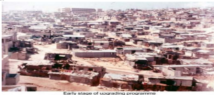
Figure .3 East District Wahdat before upgrading