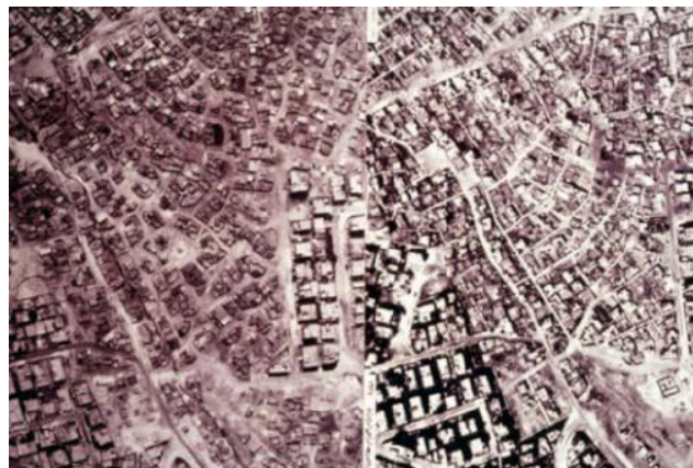
Aerial view before upgrading Figure .1- East District Wahdat.

This is a neighborhood located south-east of Amman, close to the largest Palestinian refugee camp, is al-Wahdat. It covers an area of 9.1 hectares, counts 50.300 inhabitants and 524 buildings abusive (90%) and 58 shop. The buildings are all made with material not stable as zinc and sheets, have a maximum elevation of two floors; the height of each plan does not exceed two meters and all these houses are free services and ventilation. The trace of streets and alleys is irregular and spontaneous and not connects all the houses in the neighborhood. The choice has fallen on this district because it satisfies all the requirements mentioned above. The policy applied in this district was to give the possibility to the inhabitants of purchase - accessing loans - soil on which rises the abusive House (by then reconstruct according to the regulations in force) and use the proceeds of the sale of the land to build all the infrastructure networks (Housing Corporation HC, Urban Development Department UDD), (AL ZOUBI Ahmad, the experience of the UDD in Jordan, residential studio 1991-1992, Amman).