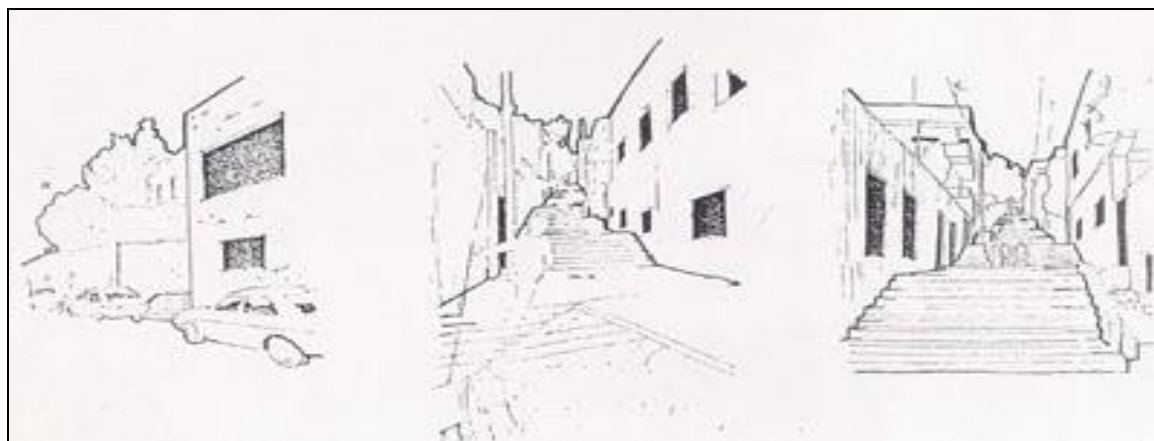
Figure.8 The models of living in the upgrading proposed by public entities