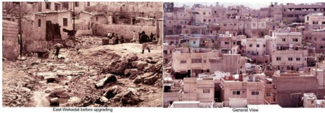
Figure 2.A- B - East District Wahdat general view before upgrading: it is evident that there is considerable degradation from the abandonment of the district by government bodies.