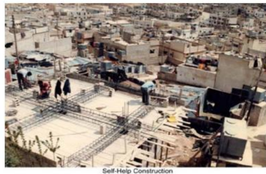
Figure.6A-B.The models of living in the upgrading proposed by public entities House Corporations (H.C., UDD) three type of auto constructions