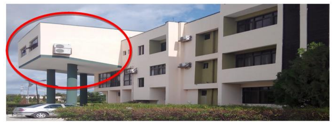
Exposed Pentagonal shaped Senate Chamber

Ground Floor Plan showing the shape of the Building (Bad Orientation)