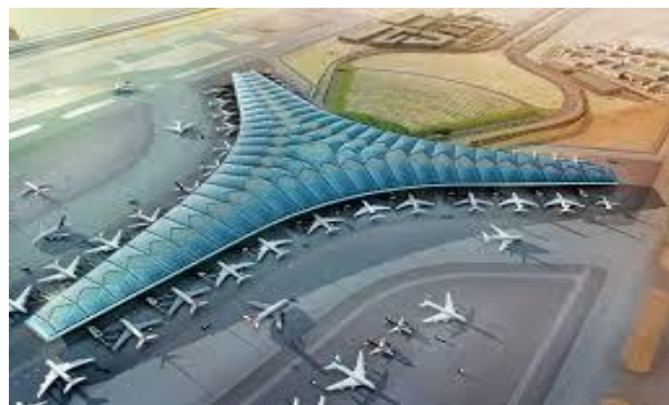
Fig.6 Kuwait airport in 2020