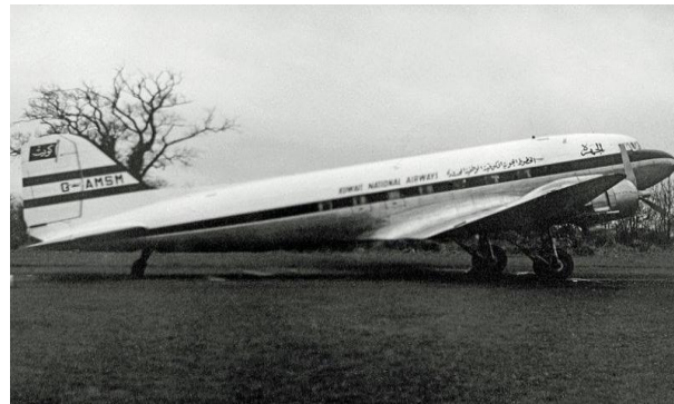
Fig.2 Kuwait aircraft in 1954

In 1954, Kuwait came up with a national carrier, Kuwait National Airways Company Limited. Pilots were trained and given recognition by both Kuwait and Britain. In 1955, the name was changed to Kuwait Airways Corporation and it grew bigger as a company when the government of Kuwait put in more investments into the company. In 1956, the government established its Kuwait Civil Aviation Department, where Kuwait Airport reported to. The said Civil Aviation Department was responsible for formulating Objectives and drafting Aviation Affairs Policy (History, 2017).