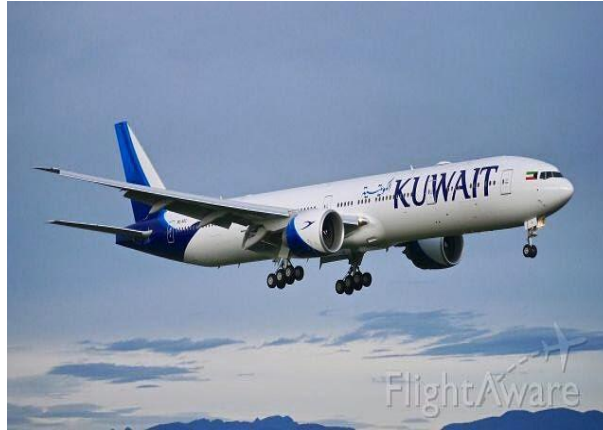
Fig.5 Kuwait airways in 2017