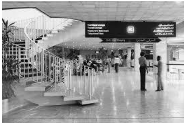
Fig.4 Kuwait airport in 1980