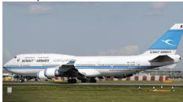
Fig.3 Kuwait airways in 1975

Moreover, in 1975, the Civil Aviation Department was renamed as Directorate General of Civil Aviation (DGCA) and is headed by a Director General, whose rank in the government is equivalent to Undersecretary. Through DGCA, the Kuwait Government continued to enhance its airlines and passengers facilities at Mugwa Airport to welcome further growth and development. Millions of passengers come and go within a 24-hour operation. Communication lines have also improved and the use of technology has also increased its sophistications that cater to the increasing demand for sophisticated technology that support the aviation industry as well as the tourism industry.