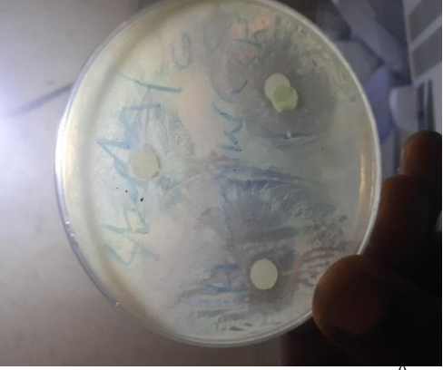
Figure 4: A sample of the sensitivity disc, incubated after 24hour at 37°C. Showing the zone of inhibition against bacteria.

Effect of sanitizer samples on pathogens. (+) = level of significance against microorganisms. S=Sensitivity, R=Resistant