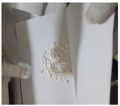
Figure 1: A standard, locally prepared sterilized sensitivity disc, impregnated with AFIT, sample B, C, and D Sanitizers.

After 24hour of incubation, a sensitivity test was carried out on various isolated bacteria and fungi using the impregnated antibacterial sensitivity disc prepared from AFIT, sample B, C and D sanitizer respectively (fig 4). The table 1 shows the effect of the hand sanitizers against pure colonies of pathogens.