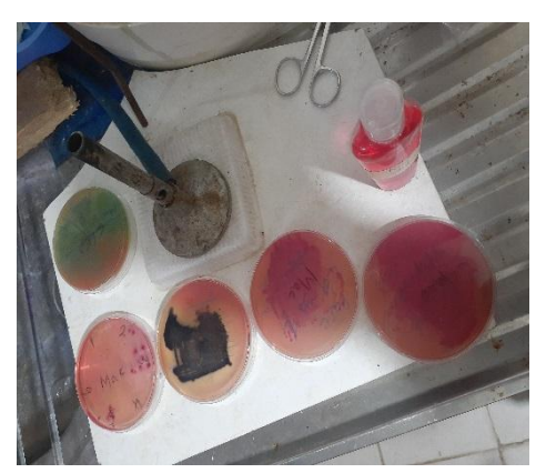
Figure 2: A pure colonies of bacteria; staphylococcus aureus , salmonella typhi , Escherichia coli , and fungi; candida spp .