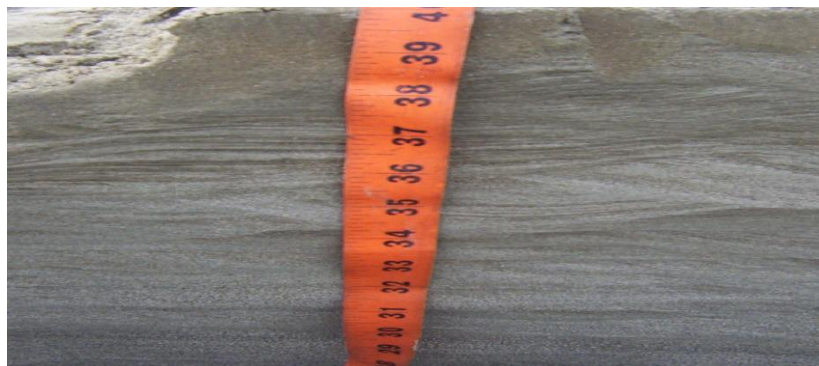
Photo- 9: Vertical profile of the river bank of the Brahmaputra showing trough cross-stratification (St) in the central part of the photograph.