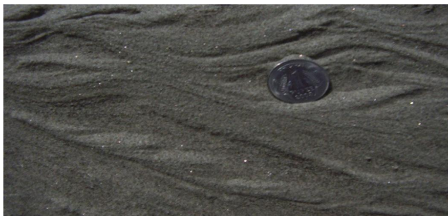
Photo - 7: Ripple drift laminated fine sand in vertical profile of the Brahmaputra river bank.