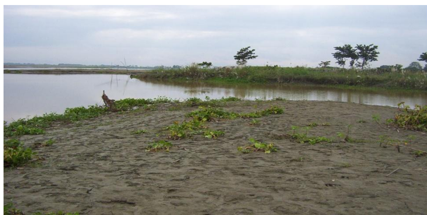
Photo-1: A view of the Brahmaputra river bank with scattered trees. Foreground is a sand bar.

The lithofacies of the bank sections indicate that the river bank was also once a part of the fluvial deposition, which was abandoned later on by some mechanism of deflection of the river channel from the present bank area. The lithofacies of the river bank shows similarity with the active bar sections of the Brahmaputra (Das et.al. 2003). Now the river is reoccupying its old course position by eroding its bank. It appears that the river is playing within its belt of jurisdiction.