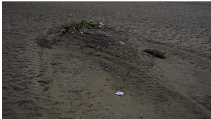
Photo- 4: Scouring of the river bed by the turbulent current generated by the partially exposed flood drifted debris. Current direction is towards lower right corner of the photograph.