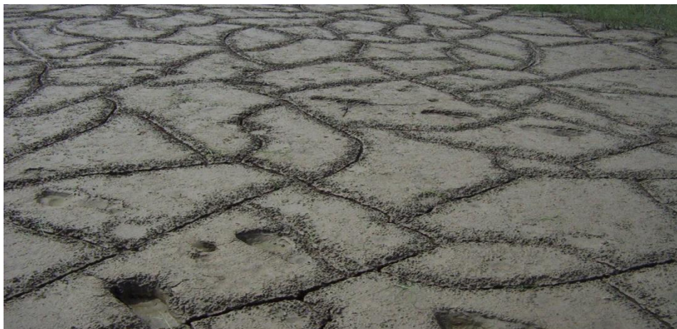
Photo- 5: Dessication cracks / mud cracks in the Brahmaputra river channel bars near study area