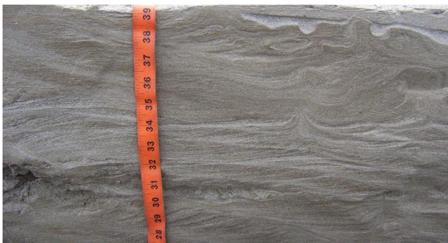
Photo.10: Vertical profile of the river bank of the Brahmaputra showing convolute structure.