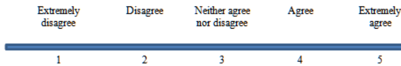
Fig 2. A five-point Likert scale [51]