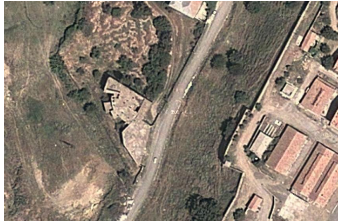
Fig2: Image of a road well defined borders (Medea, Algeria 2014)