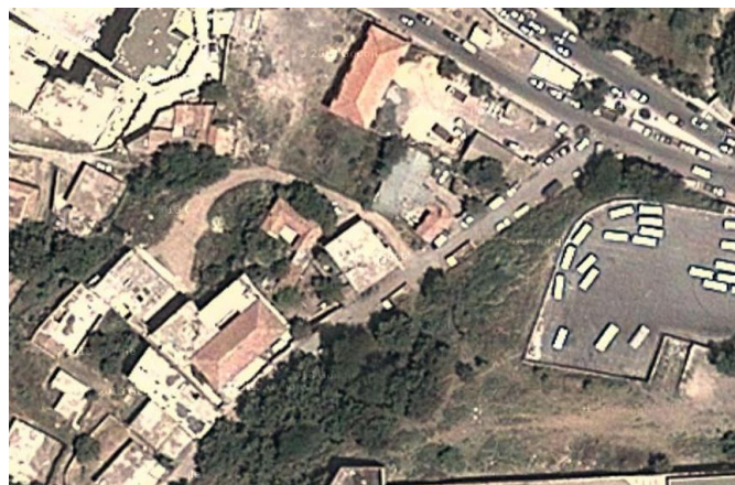
Fig 3: Image of a road not defined borders (noise: trees, cars... etc.) (Medea, Algeria 2014)

Özkaya M (2012) [32] proposes to extract both types of routes using the methods "Ribbon Snake" and "Ziplock Snake" which are derived from the traditional method models "Snake".