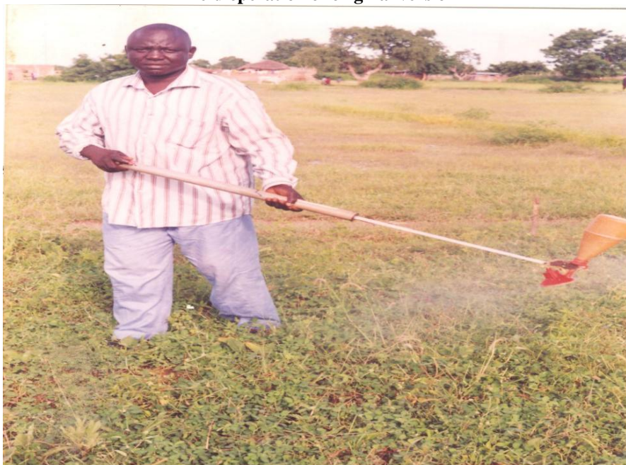
Plate1; Field performance evaluation test