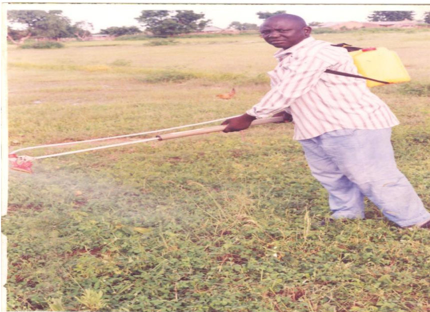
Field evaluation test of developed version

The non-pressure backpack tank developed and fabricated has coefficient of discharge of 1.02, flow rate 10.31 ml/sec, application rate 12.86 liter/ha and discharge Pressure head of 69.73kpa at 85cm of back pack tank from ground level and 25cm of nozzle from ground level. The Evaluation of the machine shows it is economical, time saving, multipurpose in application and user friendly.