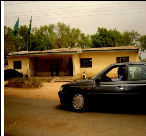
Figure 1 Area commanders office, Bosso road.

The whole town of Minna was divided into 24 neighbourhood areas according to their geographical location and socio-economic status. This then serves as the basis for the administration of 2400 questionnaires using systematic random sampling in each of the neighbourhoods. One hundred house-hold heads was used as the sample size in each of the neighbourhood who also served as the targeted population of the study.