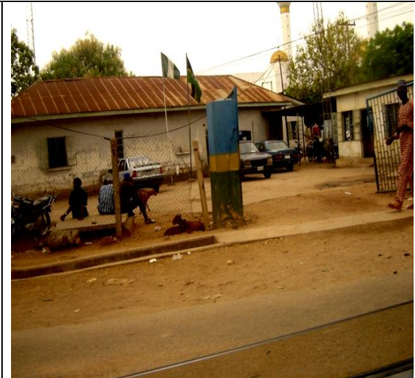
Figure 2. GRA police station, Bosso Minna.

Oral interview were carried out in each of the existing police stations/posts with the officers delegated to offer such services who also made available some relevant secondary data on their stations. Figure 1 and 2 are some of the police stations visited for the study. The ward heads (Ma-angwa) were also interviewed on the level of security and the activities of their local vigilante outfits. Secondary data acquired include the street guide map of the town, the police force periodicals, and other internet materials.