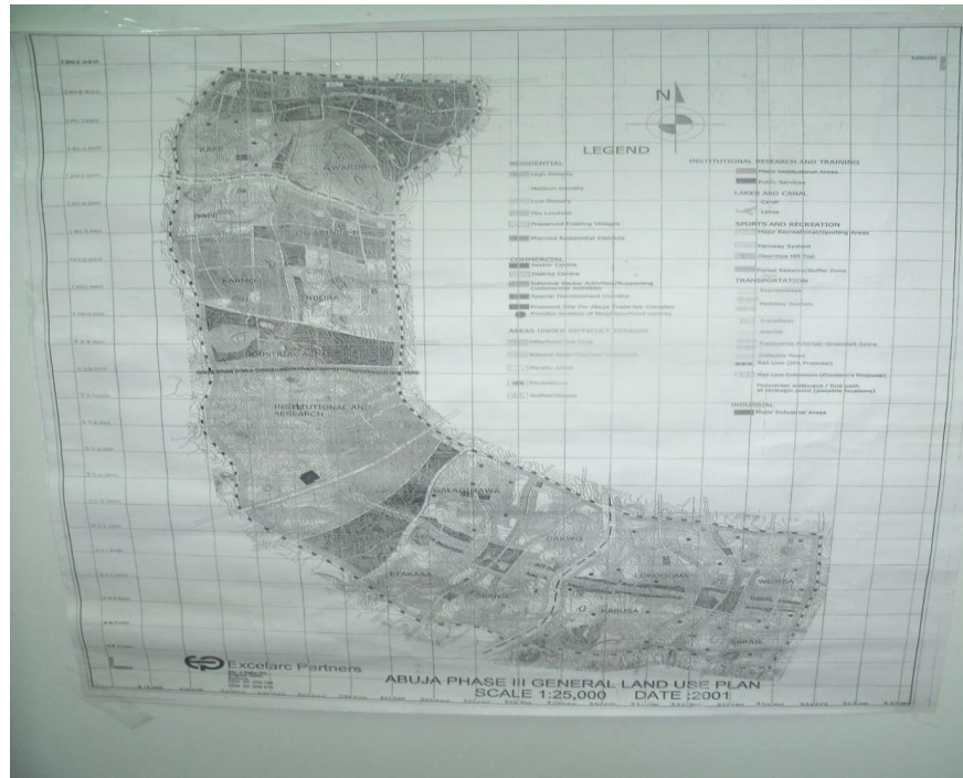
Fig 1. Abuja phase III general land use showing the industrial area 1 of FCT

The Idu Industrial area is located in the suburb of Nigeria's Federal Capital Territory, Abuja. It is a well-planned industrial zone with a functional road network and functional sewage system. The Idu industrial layout covers about 588 hectares of land that is demarcated into 208 commercial plots and is the government's approved industrial cluster for the Federal Capital Territory. The present study was conducted to monitor and quantitatively document the background radiation levels within Idu Industrial Area of the Federal Capital territory, Abuja using a radiation monitor.