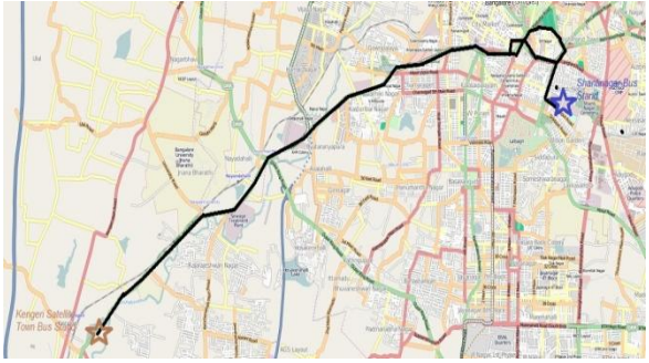
Fig.1: G-6 Bus Route

Step 2: Volume counts are taken manually at 6 major junctions both during peak and off-peak hours along the selected road stretch as shown in Fig.1 and the volume on the road is determined.